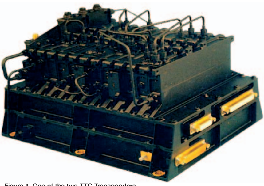
Figure 4. One of the two TTC Transponders

The TTC Subsystem is composed of two identical transponders, each consisting of several modules packaged in a single unit (Fig. 4). The receiver and transmitter of each transponder are electrically independent, except for the necessary interconnections to perform the ranging operations. The receivers and the transponders will always be 'on' throughout the satellite's lifetime, with the transmitters operated in cold redundancy. Cesa